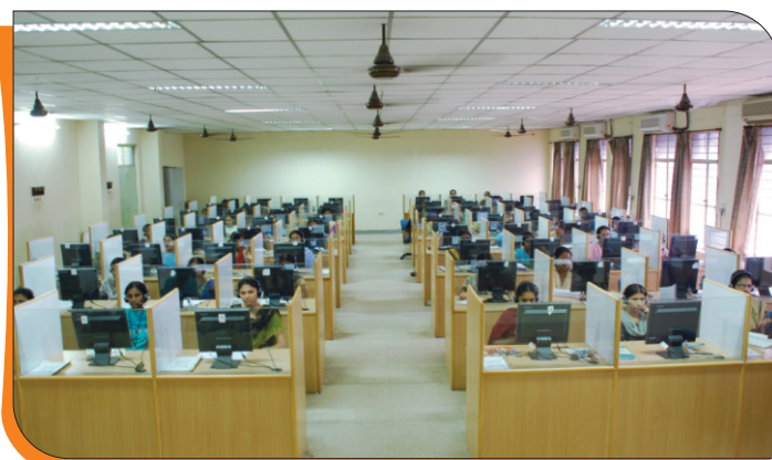
English Language Lab

Many of our students achieve GATE scores which