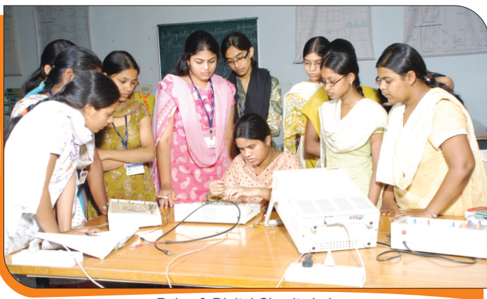
Pulse & Digital Circuits Lab