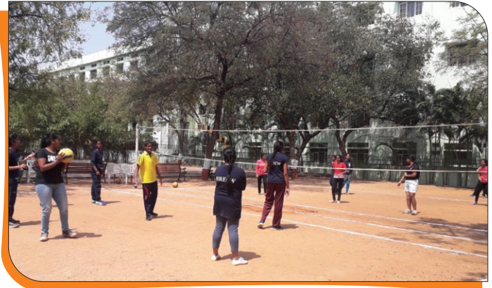
Outdoor Games Centre

The EEE course offers a wide variety of employment opportunities to its graduates. They can choose a career in Electric Power Systems, Power Electronics, Electronics and Software, etc. Electrical engineers are responsible for the generation, transfer and conversion of electrical power, while electronic engineers are concerned with the transfer of information using radio waves,