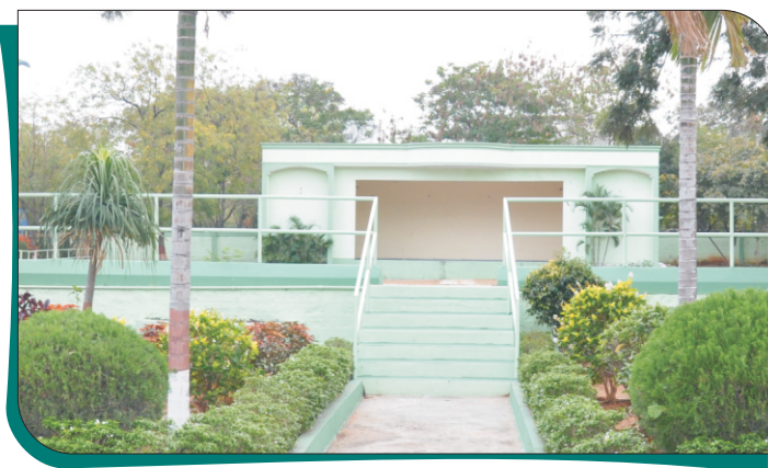
Open Air Auditorium