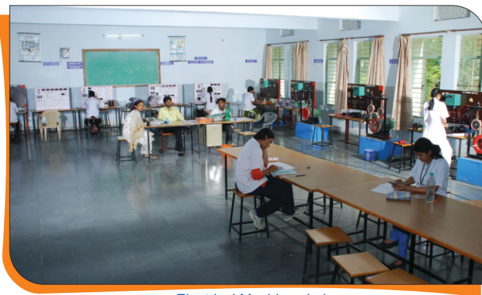
Electrical Machines Lab